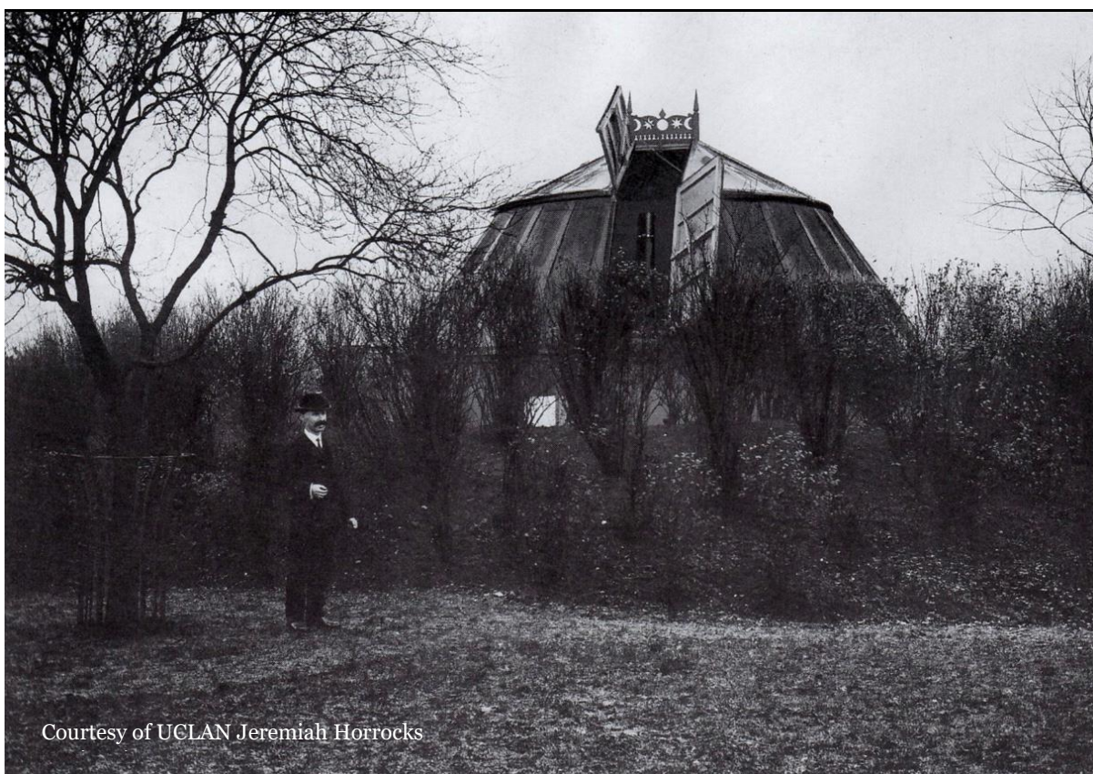
Preston Municipal Observatory – exterior view